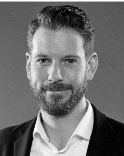
Director Agile Coaching fable+