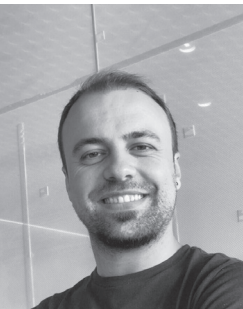
Director Agile Coaching fable+