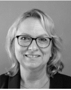
Business Coach / Partner fable+